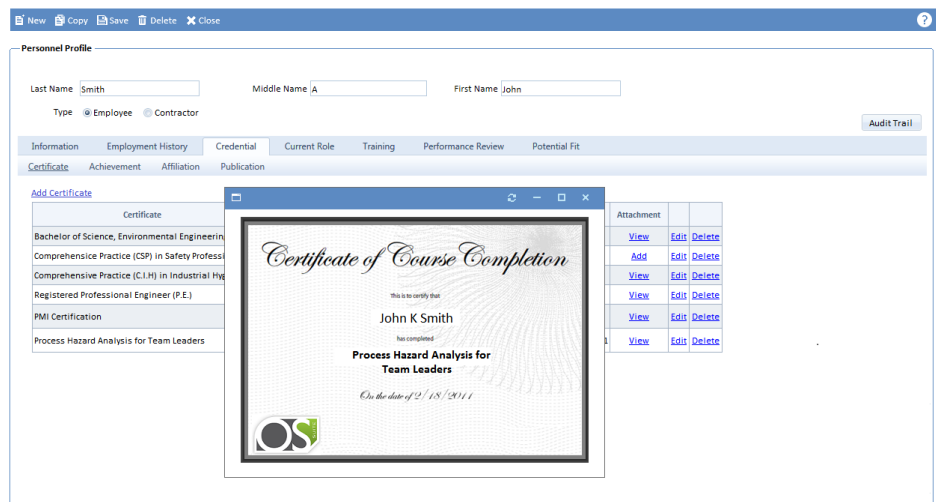
Figure 2 – OS LMS

Your HR staff can gain insight into the cost of training vs. the safety benefits derived due to the integration with our Incident Management module. Many incidents occur at startup. Our LMS is integrated with the Pre-Startup Safety Review (PSSR) and Procedure Management (PM) module to ensure that affected personnel remain current with their required training. In addition, our Competency Management module allows the training organization to assess skills, identify gaps and train