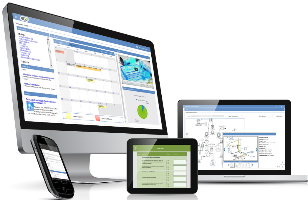
OESuite™ digital forms work across various devices

For more information email us at info@os-orm.com or call (713) 355-2900.